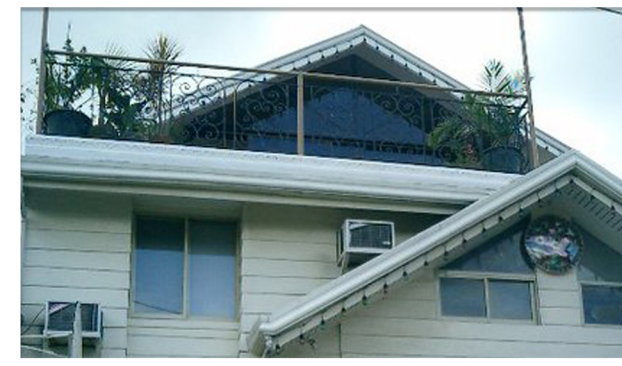
A Three storey home made with Recycled Containers