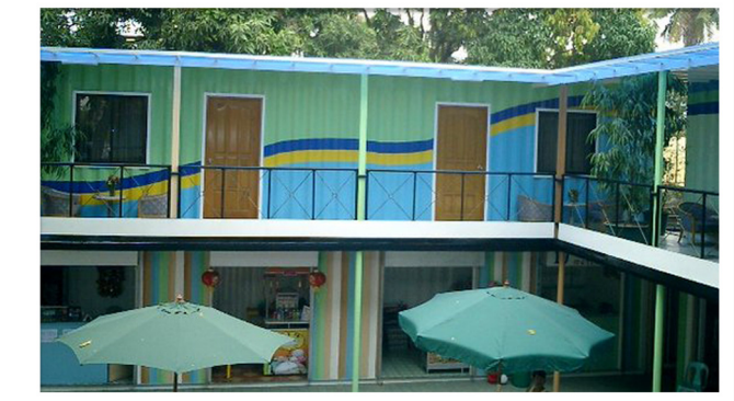
A Multi-level commercial Complex in Gapan Nueva Ecija