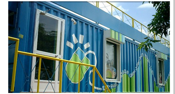
SMART Mobile Internet Cafe