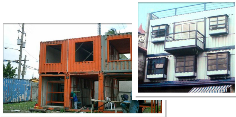
Top: Four Storey Building in Muzon, Bulacan Bottom: Pre-fabrication of a multi-level building

The van's size makes it an ideal solution as temporary off-site structures. It is also a practical alternative if you need shelter in hard to reach provincial areas.