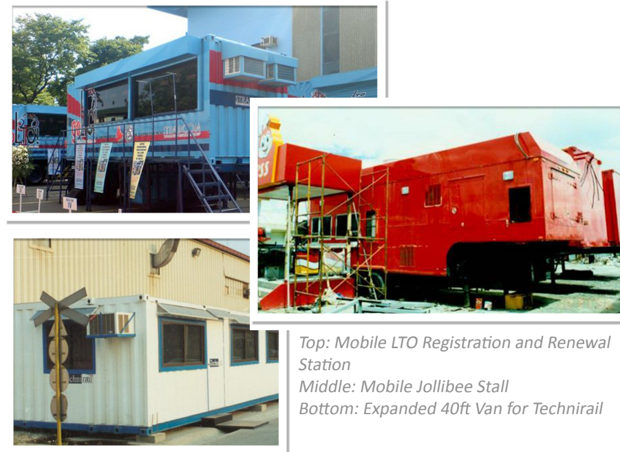
Top: Mobile LTO Registration and Renewal Station Middle: Mobile Jollibee Stall Bottom: Expanded 40ft Van for Technirail

We provide you an affordable alternative since our basic material is recycled container vans. We refurbish and restore the original structure so that it requires minimal reinforcement on the walls and ceiling. We prefabricate and convert the vans in your yard, so it is easy to install and readily available for use.