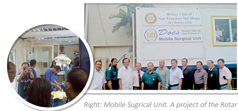
Right: Mobile Sugrical Unit. A project of the Rotary club of San Fransisco Del Monte.