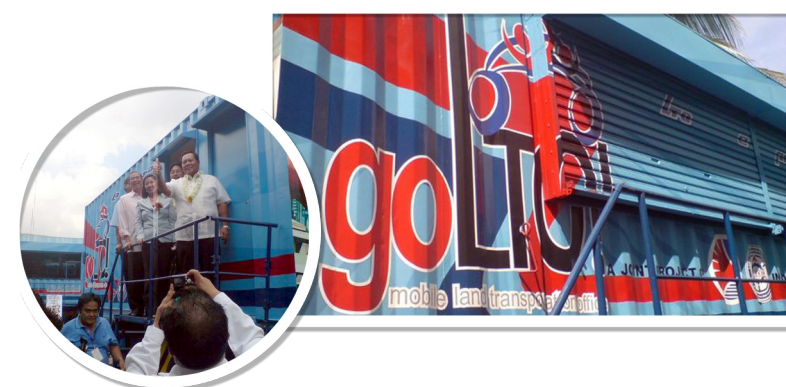
Right: Mobile LTO-Patrol Vans deployed in different regions Left: The Inauguration and Ribbon cutting officiated by DOTC Sec. Leandro Mendoza